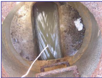
Flow measurements are taken throughout the collection system to determine the correct pump station upgrade size.

The project includes replacement of six pump stations. The new pump stations will work in conjunction with force main upgrades in other South Forced Lower Basin projects to alleviate chronic SSOs at and near these pump stations.